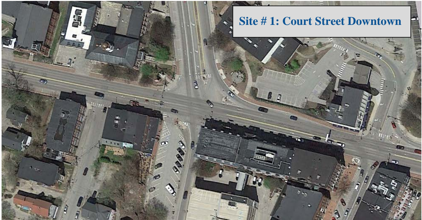
Figure 3: Site #1 - Court Street Downtown