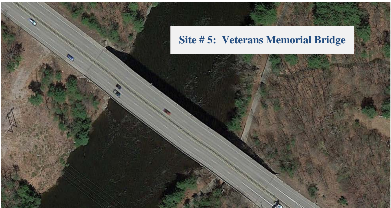
Figure 7: Site #5 - Veterans Memorial Bridge

NOTE: This area is designed with a highway-style geometry and as a result is not generally suitable for low cost short-term fixes of the type that this project is focusing on. Additional study and significant redesign is needed to raise the pedestrian level of service.