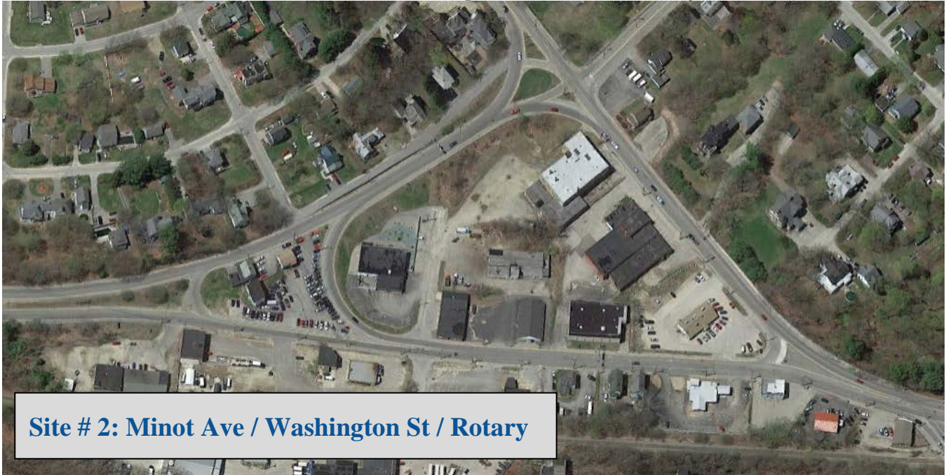
Figure 4: Site #2 - Minot Ave / Washington St. / Rotary

NOTE: This area is designed with an almost highway-style geometry and as a result is not generally suitable for low cost short-term fixes of the type on which this project focuses. Additional study and significant redesign is needed to raise the pedestrian level of service.