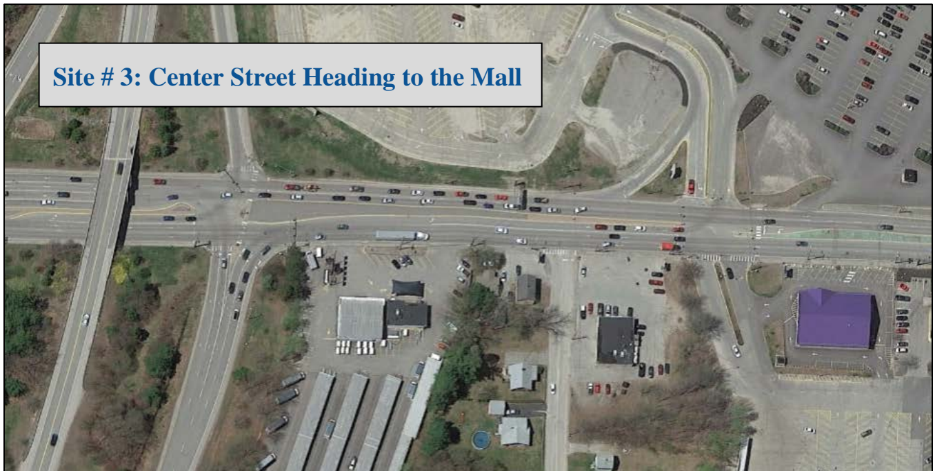
Figure 5: Site #3 - Center Street by Auburn Mall

NOTE: This area is designed with an almost highway-style geometry and as a result is not generally suitable for low cost short-term fixes of the type that this project is focusing on. Additional study and significant redesign is needed to raise the pedestrian level of service.