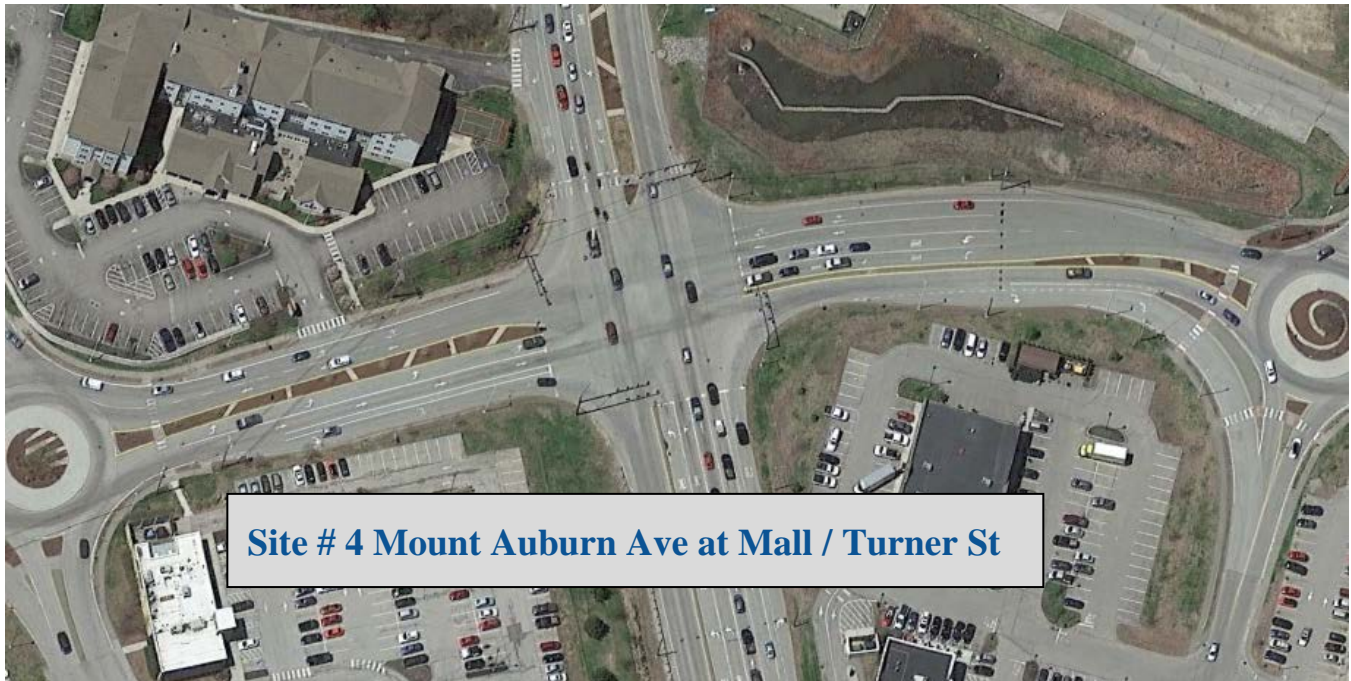
Figure 6: Site #4 -Mount Auburn Ave / Turner St